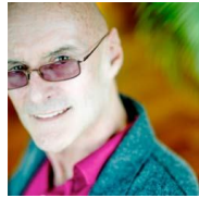
Ken Wilber. Founder of Integral Theory

"The central idea of Simpol is very powerful. That is, how to link votes in one country with votes in another; how to link political action in one country with action in another. International competition is built-in to the nation- state system at its current level of development, and so the issue is not environmental concerns, but how to get humans to agree on environmental concerns. This is really fascinating and very hopeful. In my opinion this is the crucial issue for the 21st Century".